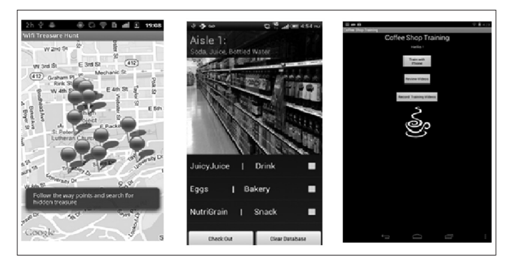
Figure 2: Android applications for healthy living and teenagers with ASDs

signals to infer human activities. Their work were published in several top conference and journal venues including IEEE Sensys [10] (one of the two top sensor network related conferences), ACM Ubicomp [11] (one of the top mobile computing related conferences). She also supervised undergraduate students to develop useful Android applications for healthy lifestyle and life-skill training for teenagers with autism disorder (Fig 2).