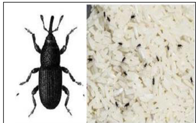
Fig. 1. Rice Weevil

the major loss of paddy rice during the processes has been estimated caused by the rice weevils. This insects also act as the transportation of storage fungi which encouraging the infestation in rice[3]. Current insects controlling methods involve the use of physical, biological, chemical methods and a few developing technology in electrical methods. However, these methods have several disadvantages and some safety concern due to their effects on the rice nutrition and consumers.