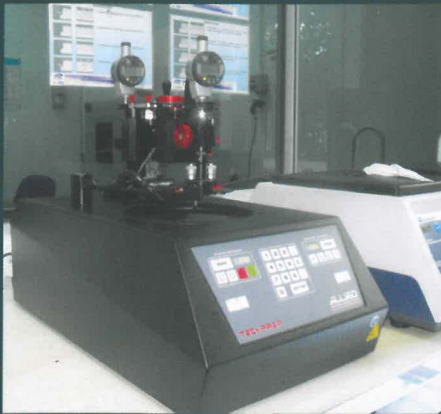
Multi-angle polisher / grinder