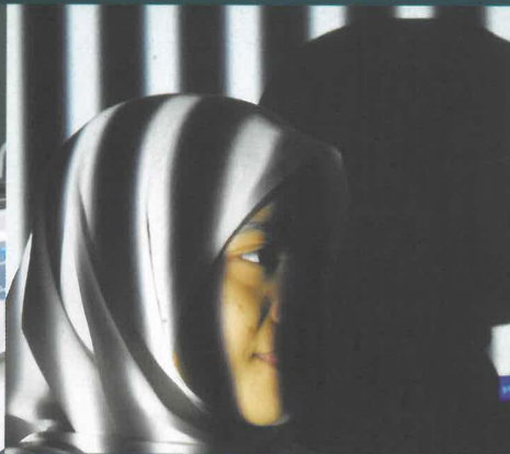
Optical fringe face detection