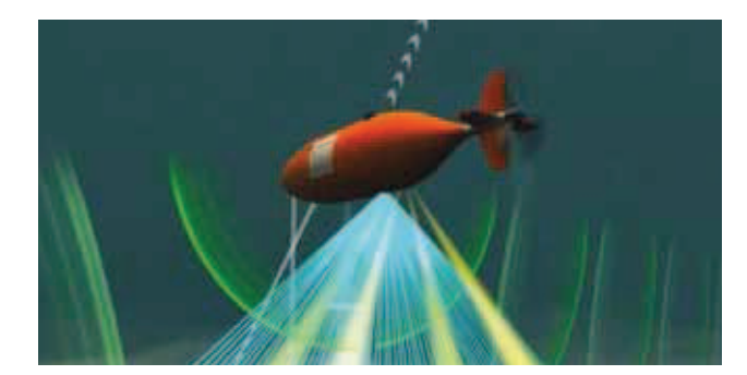
Figure 1: Sidescan sonar survey by UUV

The navigation and localisation of the underwater vehicle are a big challenge. Hence, various techniques for the estimation of the position and orientation such as an inertia, sonar and vision based systems have been developed. The sonar based system utilises the acoustic wave for communication and imaging in the underwater environment as shown in Figure 1. The sonar technology is most commonly applied in geophysical, geotechnical and environmental surveys. Minimisation of the size, improvisation of the performance and efficiency in energy consumption are some of the main challenges faced by researchers in acoustic micro design.