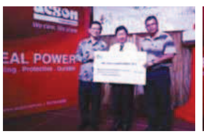
METD contributions of RM20,000 towards the Wisma IEM Building Funds