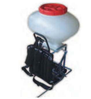
Figure 1: Knapsack Granular Fertiliser Dispenser

The equipment consists of a tapered container at the bottom, a precise metering mechanism, a hose, a long pipe and handle. When the handle is pushed down, it forces the fertiliser down through the outward holes, goes directly to the hose and pipe before it finally reaches the plant. It can distribute fertiliser accurately in amounts of 6g, 9g, 12g, 15g or 20g.