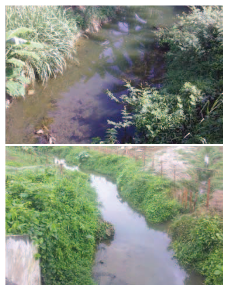
Figure 2 : Sungai Bongkok (Gurun, Kedah)

Typical metal constituents that come under scrutiny in water quality assessment include arsenic (As), copper (Cu), cadmium (Cd), chromium (Cr), lead (Pb) and nickel (Ni). Exposure to these