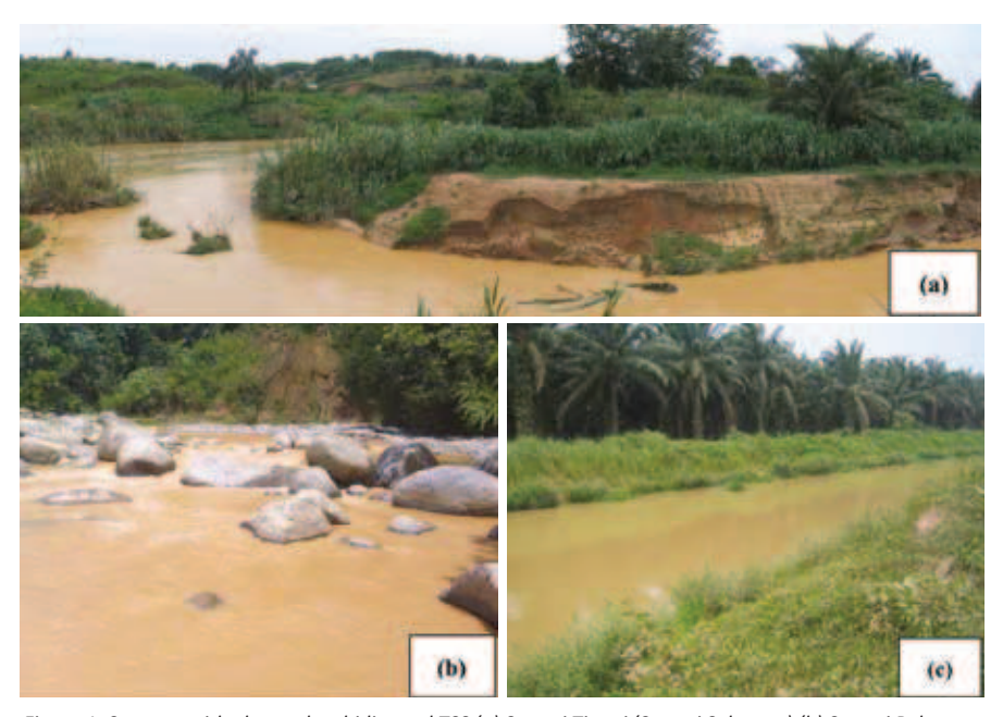
Figure 1: Streams with elevated turbidity and TSS (a) Sungai Tinggi (Sungai Selangor) (b) Sungai Belatop, Cameron Highlands (c) Sungai Dua Canal, Pulau Pinang

Water-borne pathogens usually incur short-term health impacts towards consumers due to bacterial and sometimes, viral infection. Microorganisms like these are naturally present in the environment though usually at low levels, which is also why the NWQS recommends disinfection by boiling for a Class I water source [4]. Contamination may occur as a result of fecal input from animals or domestic sewage contamination. Relevant bacterial parameters water quality assessment include total coliform, fecal coliform, E. coli, Gardia lamblia and Enterocci. Coliforms are measured in units of either cfu (coliform forming units) or MPN (most-probable number) where the former entails direct counting of microbe colonies on a Petri dish whereas the latter utilises a statistical method of quantification based on the number of positives from test tube analyses [8]. E. coli bacterium is not necessarily pathogenic (depending on the strain) but can be considered to be an indicator of