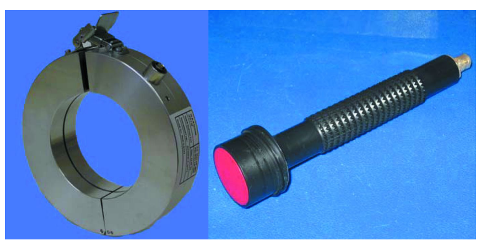
A HFCT and a TEV detector used in the demonstration