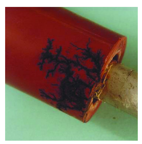
Signs of PD tracking on a HV cable insulation

Engr. Ching ended the presentation by showing some PD detected at some industrial plants in the Kerteh-Gebeng area.