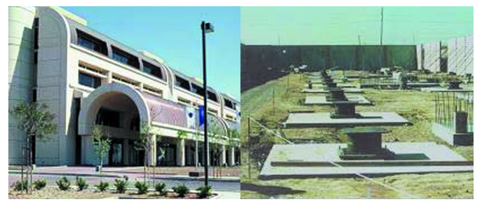
Figure 1: (Left) San Bernardino County Law and Justice Centre. (Right) Rubber bearings installed on foundations

The effectiveness of seismic rubber bearings was clearly demonstrated during the 1994 Northridge and 1995 Kobe devastating earthquakes where base-isolated buildings performed very well compared with conventionally-built structures which were either destroyed or suffered serious damage. For example, a base-isolated University of Southern California Hospital, showed a reduction in acceleration on the seventh floor by a factor of 5 when compared to the ground acceleration. In Kobe, the sixth floor of a base-isolated West Japan Postal Service Computer Centre showed a reduction in acceleration by a factor of 10 when compared to an equivalent conventionally-built building nearby.