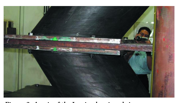
Figure 3: A pair of the Iranian bearings being simultaneously compressed and sheared at a cyclic rate of 0.004Hz