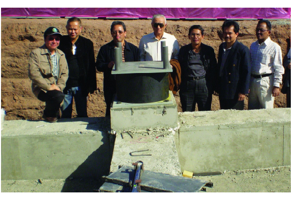
Figure 2: The first bearing for the Iranian project installed on 9 November 2007

Therefore, it is felt that seismic awareness in Malaysia and the necessary precautions ought to be given some prominence by constructing a building