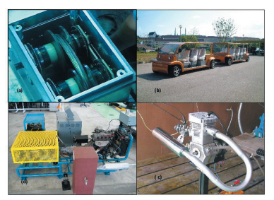
Figure 1: Research products (clockwise from top left): (a) manually-operated CVT, (b) people's mover: the Trancar , (c) two-stroke air-cooled engine, and (d) parallel-electric hybrid powerplant for automotive applications.