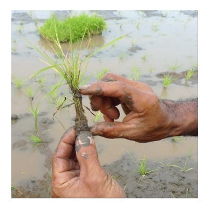
Figure 1.2: Transplanting process using conventional transplanter machine.