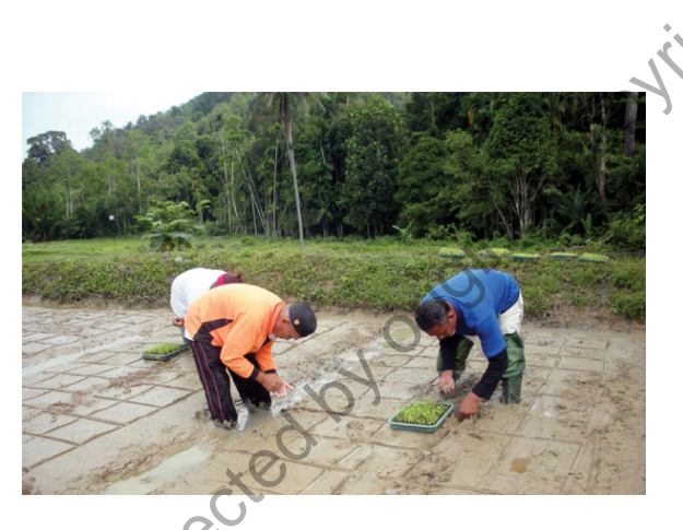
Figure 1.3: Farmers planting young seedlings manually.