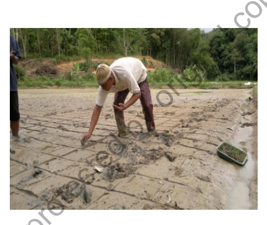
Figure 1.5: Farmer manually transplant the seedling at the intersection line.