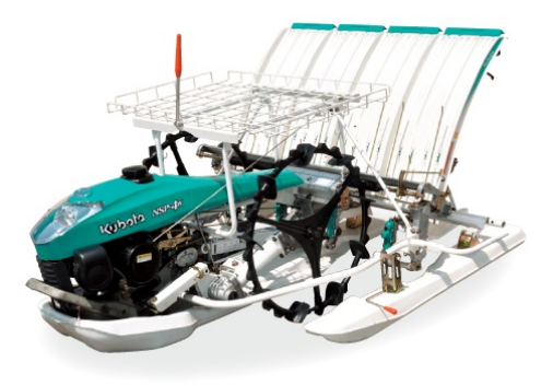
Figure 1.1: Kubota Model NSP-PW

Fig. 1.2 shows a problem that occurred when using current transplanter machine. More than one seedling are planted with conventional transplanter machine with depth of between 2 cm and 3 cm. Farmers at Kampung Lentang manually transplant the rice seedling as shown in Fig. 1.3. These techniques required them to bend repetitively which can cause fatigue. Another problem with the current technique is the transplanting process. When a seedling is transferred from nursery soil into paddy field, the young root will experience something called transplanting shock whereby the young root will be injured and need time to recover thus causing a delay in producing more tillers. Extended days for the young seedling at the nursery soil also may cause the delay of tiller emergence (E. Pasuquin, T. Lafarge & B. Tubana, 2007). The time required for the crops to recover and reinstate with the new environment is considered as waste.