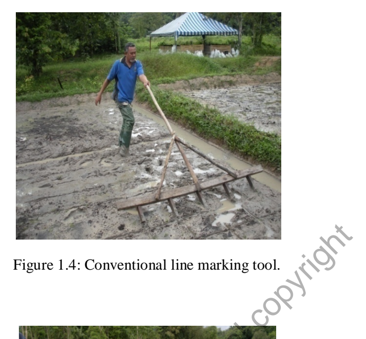
Figure 1.4: Conventional line marking tool.