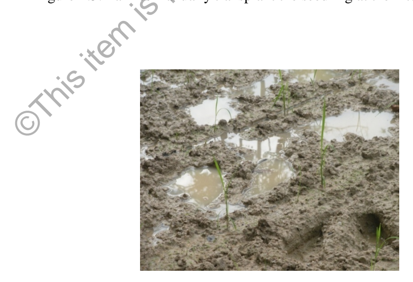
Figure 1.6: Single seedling manually planted at each point (SRI method).