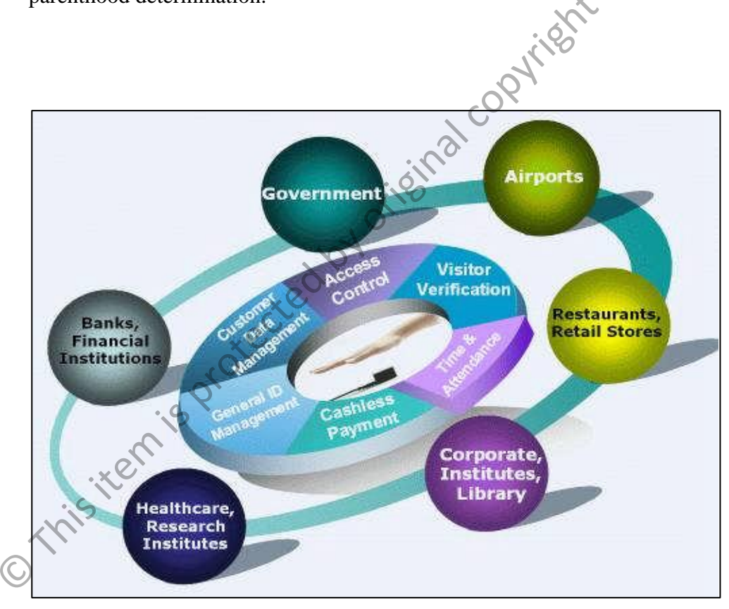
Figure 1.3: Some Biometrics Applications.