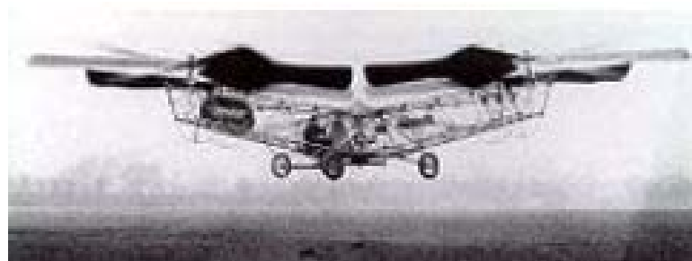
Figure 2.2: De Bothezat design.

De Bothezat was the first person who designed Remote Control (RC) based Quadrotor shown in Fig. 2.2. This design has got capabilities to fly on low altitude and was very slow in moving to horizontal motion because it has no any control algorithm for avoiding uncertainties and therefore it affected by wind very gently (Orsag, 2010).