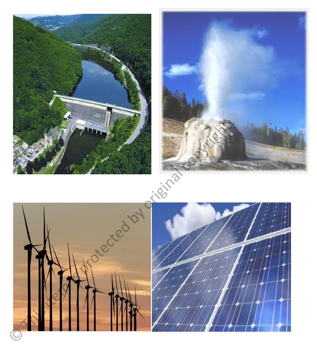
Figure 1.4: Different types of renewable energy sources.

Definitely it is not a matter to worry about running out of solar energy because it is the ultimate renewable energy available all over the world. In one hour enough sunlight reaches to the earth to supply its energy needs for an entire year. So it is not only sustainable, but also provides more than enough energy for overall demand. Researchers just need to continue improving the solar technology so that more of this energy can be captured to convert into electricity.