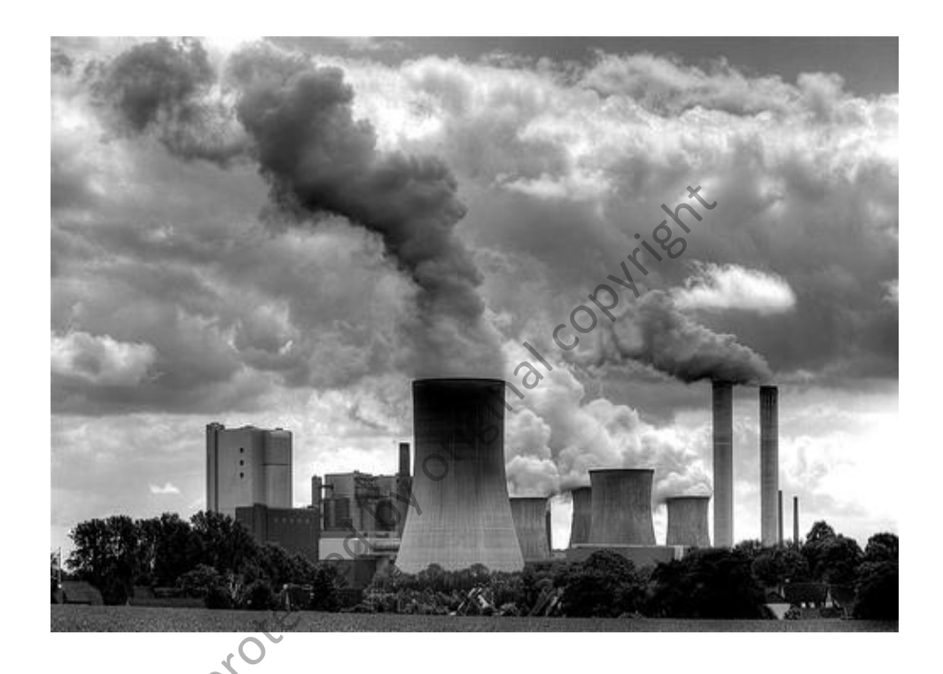
Figure 1.3: Environment pollution from burning of fossil fuels.

This is also the common knowledge that the use of fuels like oil and gas in homes, cars and industry has brought us to the problem of global warming. (Mor, Varghese,Paulose, Shankar,& Grimes, 2006).