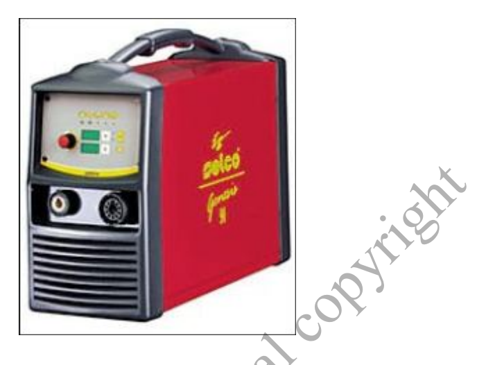
Figure 1.1 Selco Genesis 90 Plasma Arc Cutter

Optimization of process parameters is the key step in Taguchi method to achieve high quality without increasing cost such as time and money. This is because optimization of process parameters can improve quality characteristic and the optimal process parameters obtained from the Taguchi method are insensitive to the variation of environmental conditions and other noise factors. C. Montgomery says basically, classical process parameter design is complex and not easy to use especially when a large number of experiments have to be carried out when the number of the process parameters increases. The Taguchi method uses a special design of orthogonal arrays to study the entire process parameter space with a small number of experiments only (Roy, 2001).