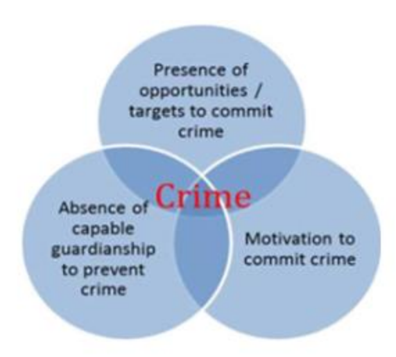
Figure 2. Routine Activity Theory in Crime

This opportunity crime theory is also known as routine activity theory. Cohen and Felson (1979) showed that structural changes in routine activity patterns can influence crime rates because of the inclusion of the following three elements as shown in the Figure 2: (1) motivation to commit crime, (2) presence of opportunities/targets to commit crime, and (3) the absence of capable guardianship to prevent crime.