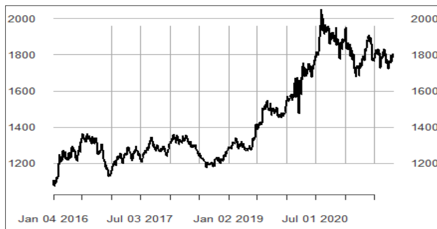
Figure 1: The Gold Price from January 2016 until October 2021

Figure 1 shows the gold price from January 2016 until October 2021. The price was moving up and down steadily until end of 2018. At the beginning of 2019, the price started to hike significantly, and the peak exceeded USD2000 by the mid 2020. The data series become more volatile as the price start the momentum at early year of 2019 and makes the forecasting process become more challenging. The increasing trend might suggest the price might not be stationary. The high volatility along the period may contribute also to instability in variance and lead to high risk.