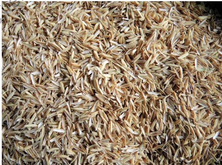
Figure 2.1: Image of rice husk (Saudi, 2015)

Rice is an important primary food source for approximately half of the population worldwide (Slayton & Timmer, 2008). About 1% of the earth's surface is covered with paddy field and ranks as the second over wheat in terms of area and production. Over than seventy countries mainly China, India, Indonesia, and also Malaysia are producing rice. Globally, approximately 600 million tons of rice is produced each year, and for per 1000 kg of milled paddy, about 220 kg of rice husk (RH) is produced which is about 22 %. Rice husk (Figure 2.1) is one of the most abundant by-products produced from rice processing. The by-product from rice agricultural includes rice husk, rice straw, and plant material. Rice husk is an agricultural crop that is either burnt or dumped as waste (Saudi, 2015).