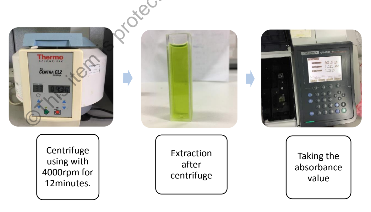
Figure 3.16: Process of Centrifuge and Absorbance Reading

The extracted chlorophyll was then centrifuged using Thermo Scientific CL2 centrifuge and the absorbance value was read by using Shimadzu UV-1800 Spectrophotometer. Figure 3.16 shows the process of centrifuge and absorbance reading.