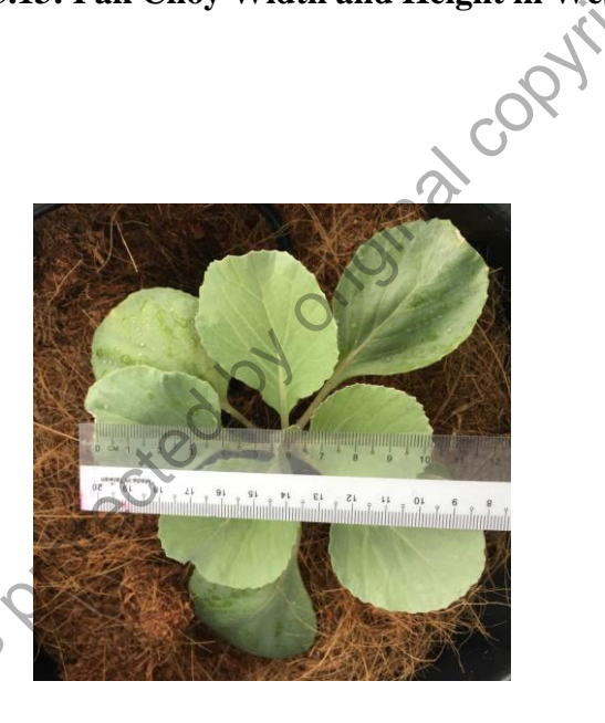
Figure 3.14: Width of Cabbage in Week 4

Figure 3.13: Pak Choy Width and Height in Week 4