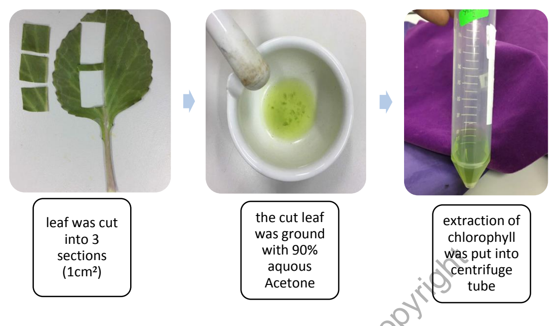
Figure 3.15: Extraction of Chlorophyll