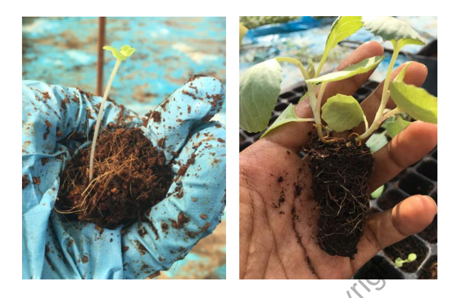
Figure 3.7: Transplanting Pak Choy and Cabbage