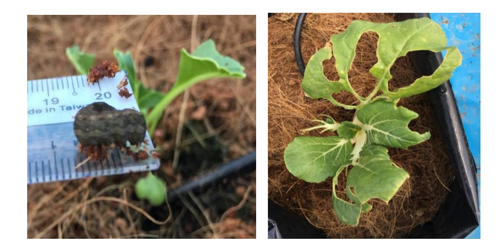
Figure 3.9: Caterpillar eats the plant before spraying insecticide