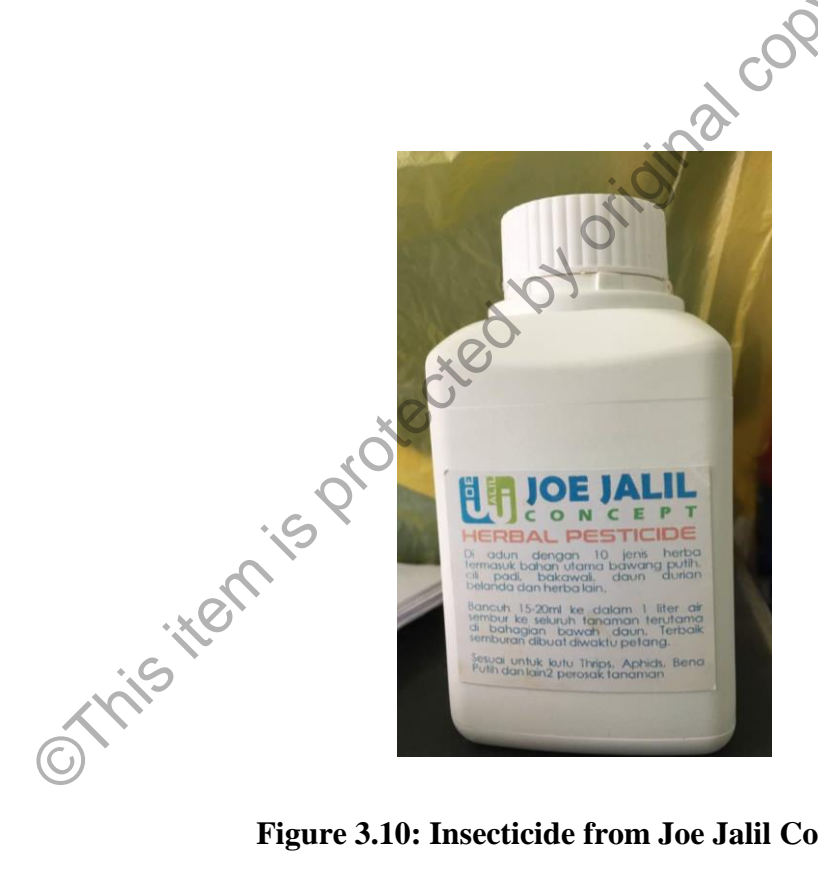
Figure 3.10: Insecticide from Joe Jalil Company