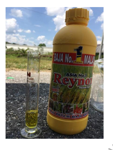
Figure 3.8: Liquid Fertilizer

Thereafter, watering and weeding were carried out uniformly on need basis on all plots throughout the study. 45 ml/s of water was piped to each polybag twice a day by drip irrigation. The motor used and the fixing of pipelines is showed in Figure 2 is protected Appendix B.