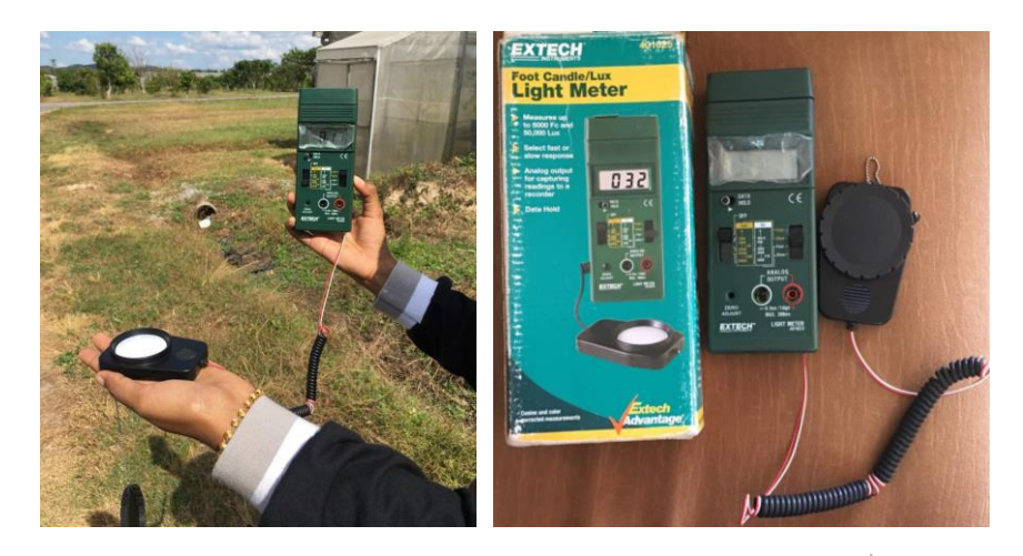
Figure 3.12: Light Meter under Direct Sunlight