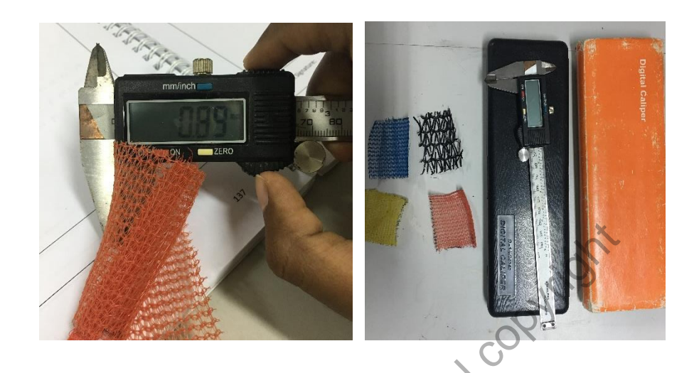
Figure 3.11: Digital Vernier Caliper

holes in 1inch<sup>2</sup> of shading net was counted. Figure 3.11 shows the Digital Vernier Caliper used for measuring thickness of shading mesh.