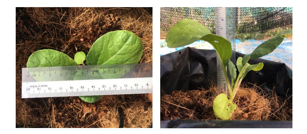
Figure 3.13: Pak Choy Width and Height in Week 4