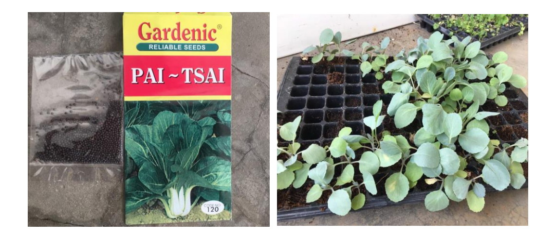
Figure 3.5: Pak Choy Seeds and Cabbage Seedlings