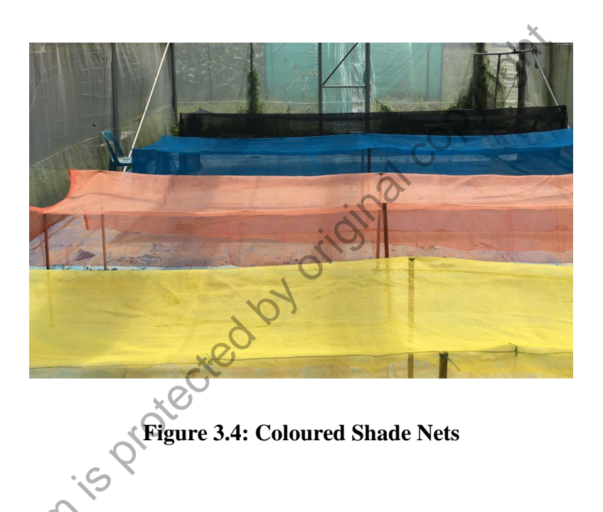
3.4.1 Crop Germination

are arranged in 5m long and 1m high, after being secured 0.2m into the ground. The yellow, red and blue shading nets with 70% shading factor were manufactured by Yize Wire Mesh Factory, China. Meanwhile, black net with 50% shading factor was purchased from a retailer in Kangar, Perlis. These nets were made from high-density polyethylene plastic, which makes them durable with a potential life span of up to 2 years. The process of fixing the wooden plunks and hanging the shading nets over the woods showed in Figure 3 Appendix B.