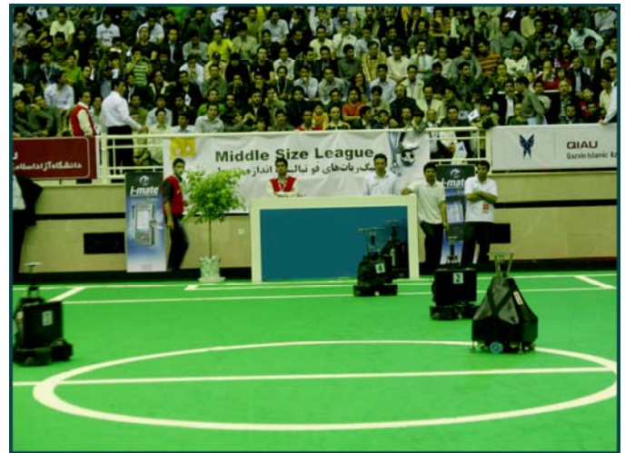
Fig. 1. Adro team formation control against MRL attacker robot

including attacker, defender, supporter and goalkeeper. The simplest role selection strategy is to have a fixed role that does not change throughout the game. However, permanent role causes undesirable behavior such as a defensive player not going for the ball even though the ball is near but outside its defense zone or a forward player giving up its possession of ball when it incidentally enters a defense zone. The main objective in competitive environment is to score goals; and if a player is in a better position to secure a scoring chance, it must be given the opportunity. A cost function evaluates some parameters like the ball distance, localization, player's orientation towards the ball, etc. and obtains a value for each role. This parameters will be calculated periodically and roles will be assigned to robots according to the values obtained.