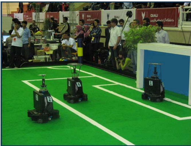
Fig. 2. Defense strategy with two robots