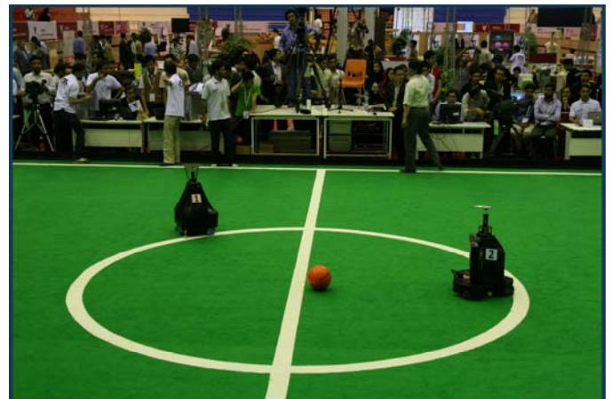
Fig. 4. Distance to ball certain robot attacker role

The information sent is its own location, and an estimation of its distance to the ball. Coordination information is sent at 5Hz. When one robot receives coordination information it updates data associated to the corresponding robot in its global model. This global model stores position of the teammates and, combined with the position of the ball is used to calculate utilities functions.