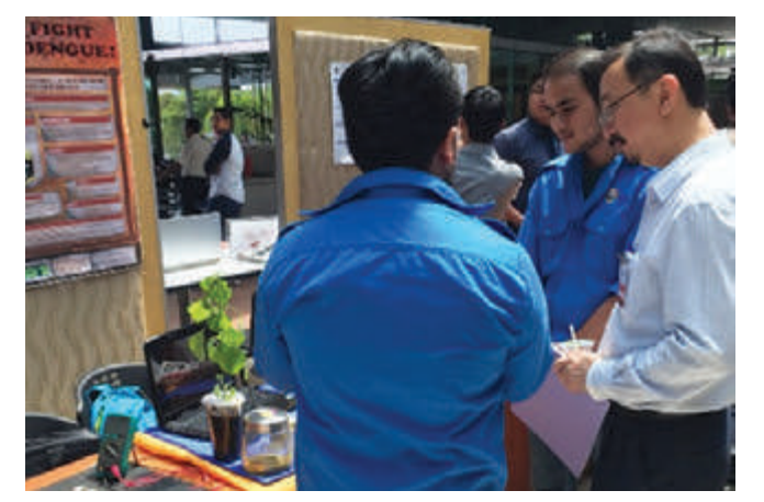
Committee promoting the event

Apart from making available judges for the Inotech Design Competition, E2TD helped promote the event in IEM's publications, magazine and bulletins as well as endorsed APU as a partner in design innovation for the development of Science, Technology, Engineering and Mathematics (STEM) education in Malaysia.