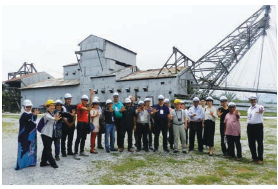
Visit to a relic tin dredge in Tualang – heritage of Malaysia's tin production days

exulted from people coming together to express their thoughts, share ideas and enjoy the company of each other. The innocuous way that international meetings can promote friendship, understanding and a