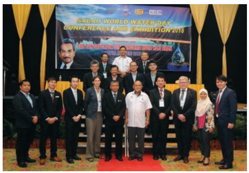
Speakers for The Conference