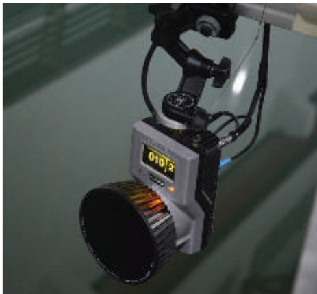
Towing Tank Wave Generator Motion Camera