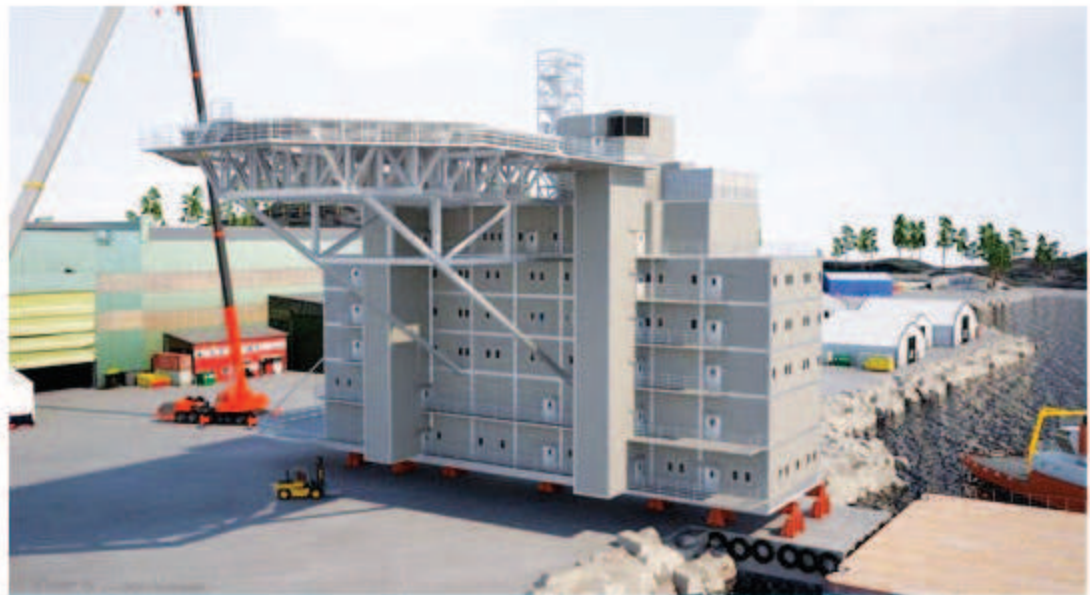
Living Quarter Building Module (LQBM)