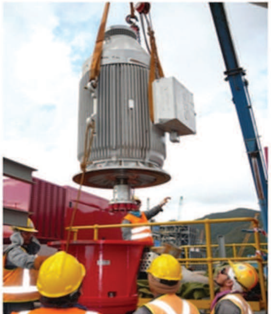
Vertical Turbine Pumps