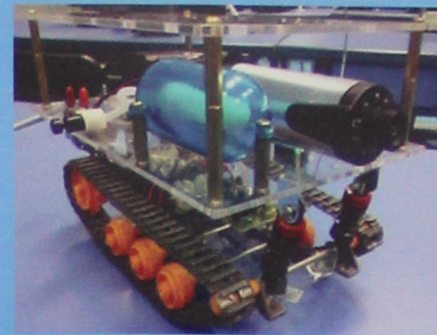
Figure 1: Overall view of Electric Vehicle

Fuel cells (FCs) is device that utilize an electrochemical process to convert chemical energy of the fuel into electrical energy. This electrical energy can be used to power vehicles, electronic devices, houses and etc. Hydrogen is the most common fuel in the fuel cell system, but hydrocarbons such as natural gas and alcohols like methanol are sometimes used. This project is about developing a Hydrogen Fuel Cell Electric Vehicle (HFCEV) that run by electric current that produce from the Polymer Electrolyte Membrane (PEM) fuel cell which is being carry onboard in the vehicle.