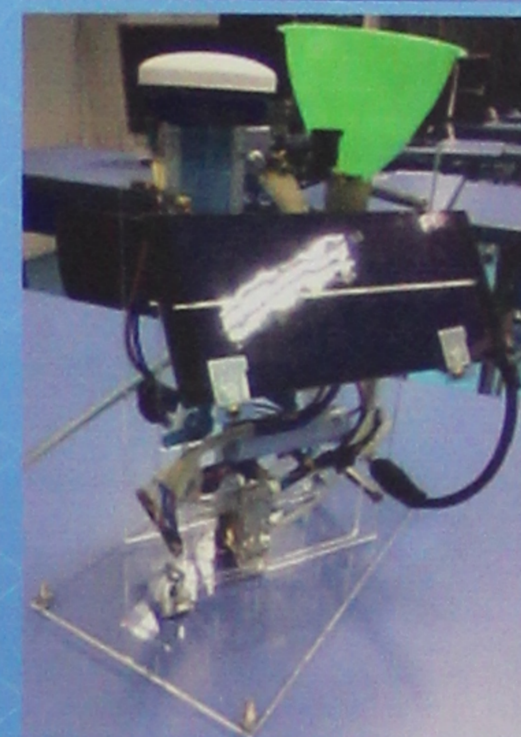
Figure 2: Hydrofill Refueling Station