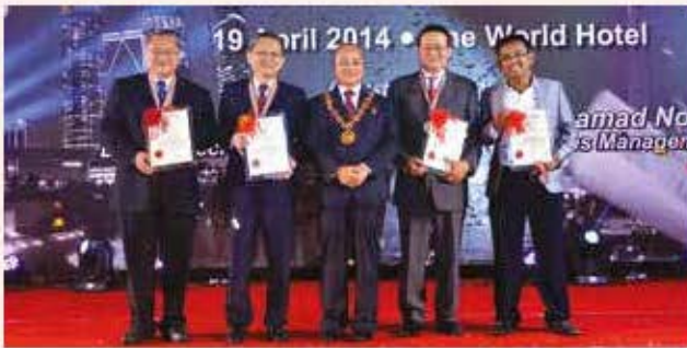
Recipients of the IEM Distinguished Member and IEM Honorary Fellow

"Climate change is potentially one of the most disastrous outcomes arising from the damage we do to our environment. It is the result of the inability by the natural environment to handle all the changes that have been inflicted on it, so I ask all IEM members to put environmental concerns at the centre of your work and address the issues of climate change.