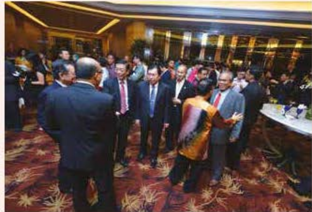
IEM members, guests and VIPs had a lovely time at the cocktail reception of the Annual IEM Dinner in One World Hotel