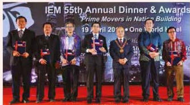
Recipients of the Presidential Awards of Excellence