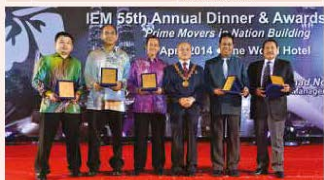
Recipients of the Most Supportive Organisation/Individual Awards