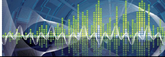
Image Processing, Image Analysis and Real-Time Imaging (IPIARTI) Symposium 2014 Symposium on Acoustic, Speech and Signal Processing (SASSP) 2014

30 th April 2014, Universiti Malaysia Perlis (UniMAP), Pauh Putra Main Campus, Perlis, Malaysia.