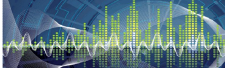
Image Processing, Image Analysis and Real-Time Imaging (IPIARTI) Symposium 2014 Symposium on Acoustic, Speech and Signal Processing (SASSP) 2014

24 th April 2014, Universiti Malaysia Perlis (UniMAP), Pauh Putra Main Campus, Perlis, Malaysia.