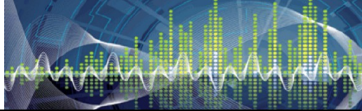
Image Processing, Image Analysis and Real-Time Imaging (IPIARTI) Symposium 2014 Symposium on Acoustic, Speech and Signal Processing (SASSP) 2014

24 th April 2014, Universiti Malaysia Perlis (UniMAP), Pauh Putra Main Campus, Perlis, Malaysia.