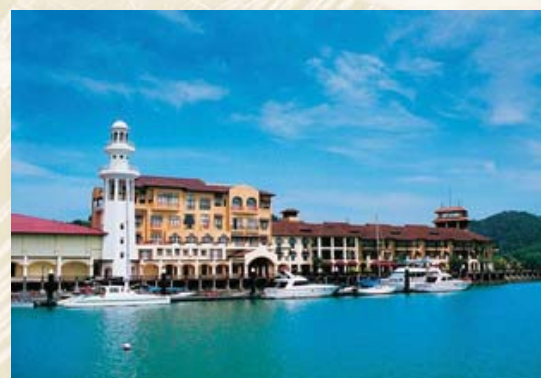
Resort World, Langkawi Island, Malaysia