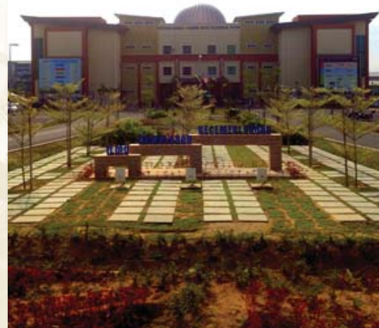
Tuanku Syed Faizuddin Putra Library, Universiti Malaysia Perlis