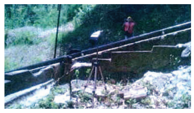
Figure 8: Noise monitoring during construction

From the heritage conservation perspective, the concerned parties questioned what would happen to the middle station if the single section proposal was adopted. The designers proposed that the middle station could be preserved as a museum – a museum where tourists would have the opportunity to see an actual funicular machine room. One of the four displaced coaches would also be placed at the middle station to complete the museum.