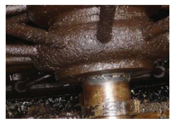
Figure 5: The over-welded bull wheel