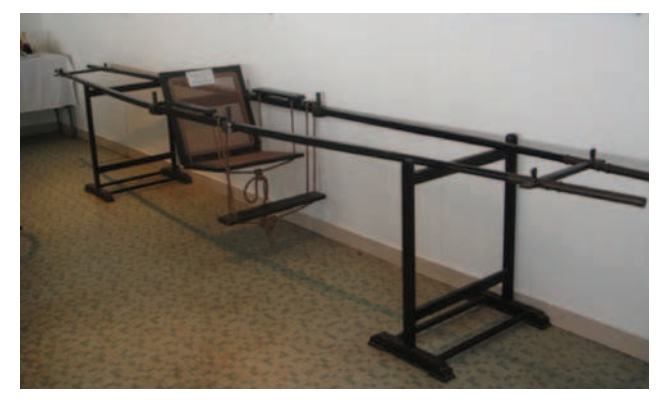
Figure 1: The earliest mode of Penang Hill transport

To access Penang Hill, a rough track had been cut as early as 1787 through the rainforest to the signal house on the crest of the ridge overlooking Georgetown. Access to the hill station was done in two stages: from Georgetown to the foot of the ridge on horseback or by palanquin or gharry (usually a two-wheeled carriage or cart drawn by a horse or pony and plying for hire), and from there to the crest of the ridge by a Sumatran pony or in a sedan chair (Denny, 1894) (Figure 1).