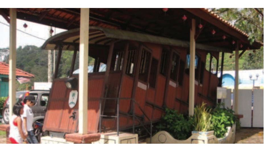
Figure 3: The original coach displayed on top of the hill

The government had proposed the upgrading of the funicular system with a view of arresting the increasing demand for maintenance as well as improving the safety, comfort and capacity of the system. The antecedent system broke down frequently and its unreliability was a great blow to the hill tourism industry. From 2003 to 2004, the funicular system was closed for eight months due to equipment failure. On 24 April 2005, a load of tourists was trapped on the hill for three hours when a brake malfunctioned. On 31 July 2009, 300 tourists were stranded on the hill when the traction system failed.