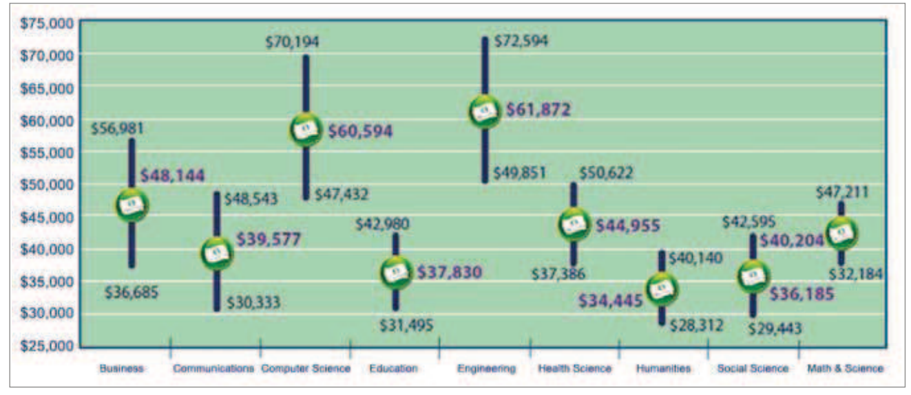
Figure 1: Starting salaries for new college graduates from the National Association of Colleges and Employers (NACE) salary survey in the United States of America [<sup>3</sup>]

Registration as a Graduate Engineer with Board of Engineers Malaysia (BEM) – A Graduate Engineer registered with in BEM has undergone and satisfied all the necessary curriculum of an accredited engineering programme.