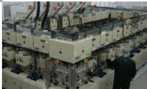
Process 2 : Sputter Process