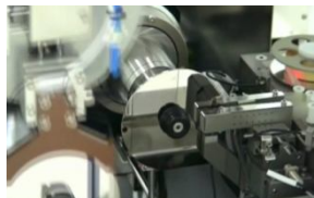
Process 3 : Lube Process

“Technical Talk for Media Manufacturing Process” by Western Digital Media Sdn Bhd are open to all staff , 3 rd & 4 th year including postgraduate students.