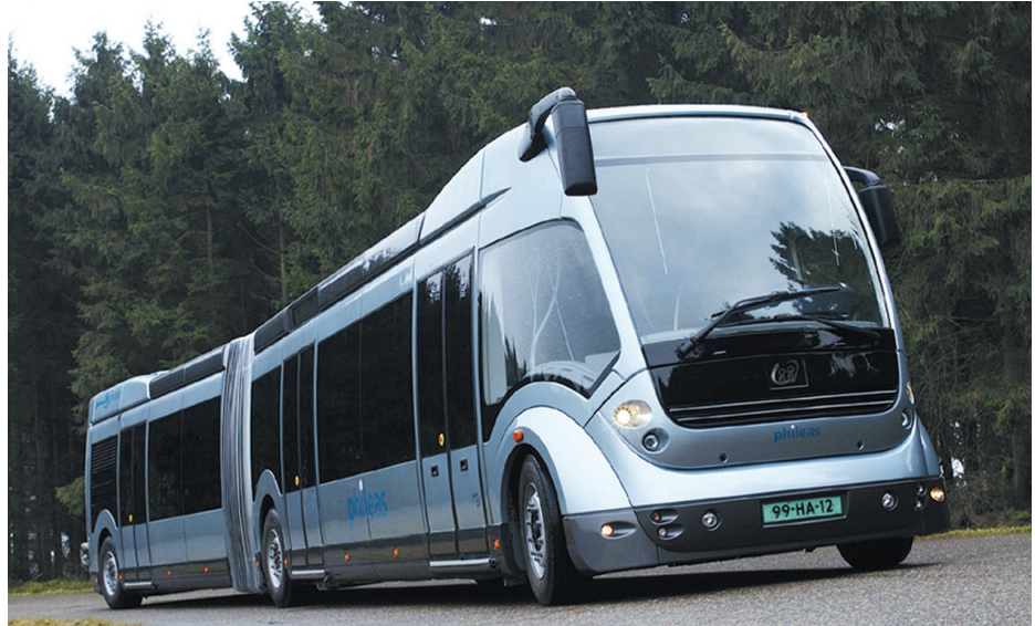
Figure 1 shows the PHILEAS bus on the road

Bus Rapid Transit (BRT) is a high quality, customer orientated transit that delivers