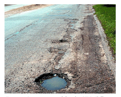
Figure 3: A pavement candidate for CIPR (full depth reclamation) Among the distresses identified include deep cracking, reflective cracking, pothole, rutting/shoving and insufficient base strength

However, CIPR does not correct pavement with subgrade related distresses. In this case, the existing pavement structure must be disturbed to improve the subgrade first by other methods. CIPR is also not recommended for pavement with subgrade CBR value of less than 3 percent unless the subgrade is improved or adequate depth of cover is provided for the subgrade [6]. This is because it is difficult to compact the recycled material effectively on poor subgrade support.