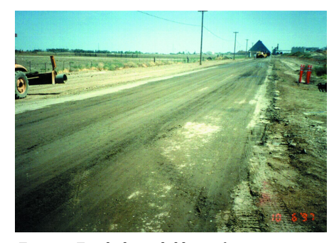
Figure 7: Finished recycled layer after compaction

density and to prevent over-compaction. Nuclear density gauges is unreliable because it overstates the moisture measurement of recycled layer due to the presence of bitumen (bitumen stabilise layer) while sand replacement method is labour intensive and time-consuming.