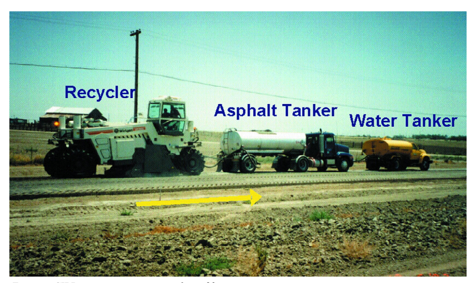
Figure 1: CIPR equipment train using foamed bitumen

This article attempts to provide a brief introduction to the CIPR process, equipment for the process, selection criteria for the suitable pavement candidate, mix design, construction process, quality control and finally, the