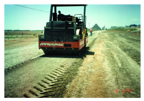
Figure 6: Compacting the recycled material with a roller