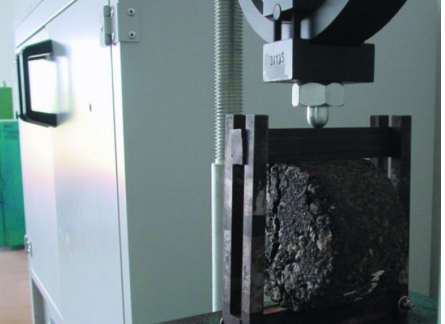
Figure 8: Indirect tensile testing of foamed bitumen briquette

(1) High acquisition cost of the CIPR equipment,