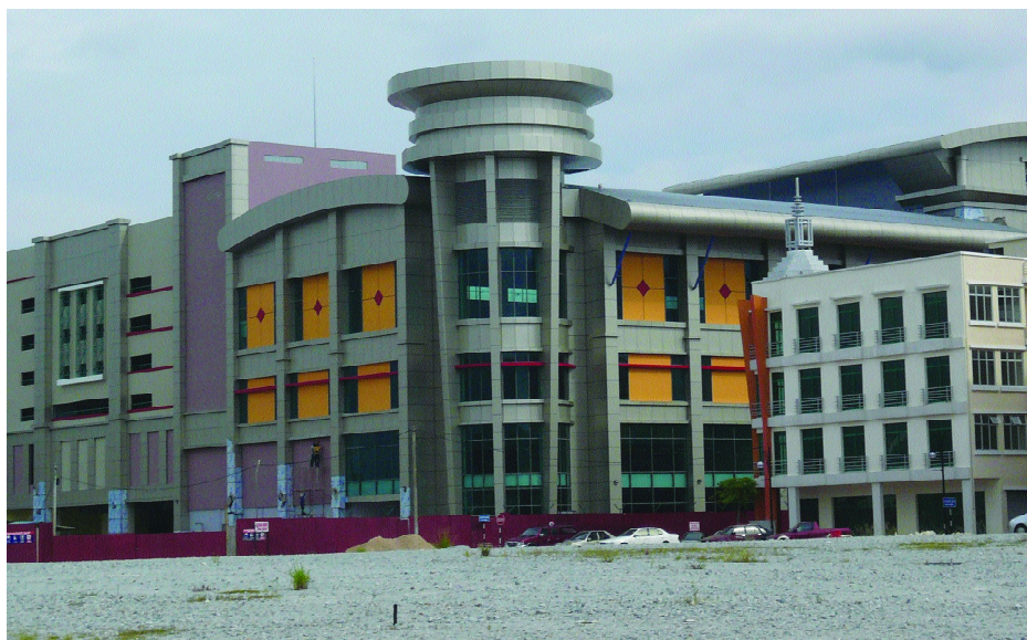
Engineering decisions made on commercial buildings should be relevant to the estate value

Most of the time, 'significant savings' can only be achieved with substantial alterations to an existing system or the introduction of costly energy efficiency measures which makes the ROI less