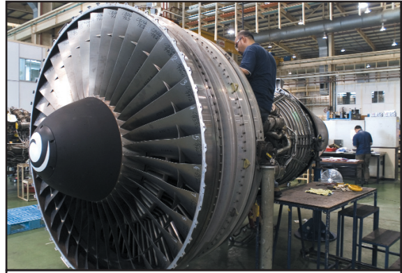
Inspecting the Pratt and Whitney 4000 94-inch engine

Apart from the aforementioned gantry system, a large-scale RM 35 million expansion project is currently underway. The expansion provides the capability to overhaul the CFM56-5 and CFM56-7 aircraft engines by 2007/2008, in order to cater for an estimated influx of new Airbus A320s and Boeing 737-800's in the next 2 years (AirAsia inked a deal to bring in 60 Airbus A320 with 40 on option for the next 6 years 2