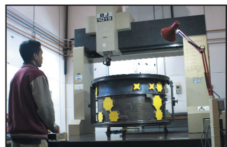
An engineer works on the highly-precise co-ordinate measurement machine (CMM)