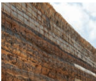
Geogrid Wall of VSLF

The visit ended with an exchange of souvenirs between Ir. Dr Oh Seong Por and Encik Rizal, followed by group photography session in front of the EPIC building. ■