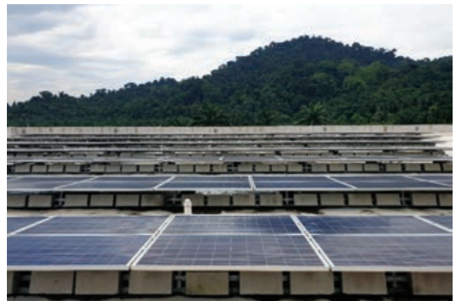
Solar Panel Unit at EPIC

Delegates were also allowed to visit the Emergency Response Command Centre. This is actually an in-house fire station, manned by trained ex-firemen and is equipped with complete firefighting assets such as a fire engine and