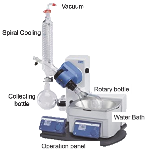
Figure 1: Rotary evaporator