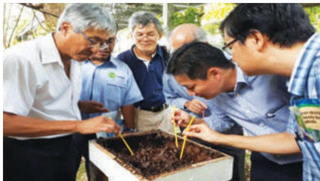
Delegates at the bee farm