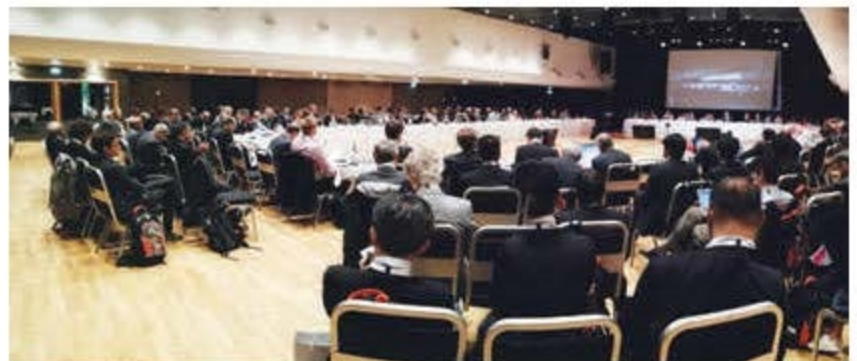
43rd ITA – AITES General Assembly in Session

For more information, visit http://www.seacetus2017.com/ ■