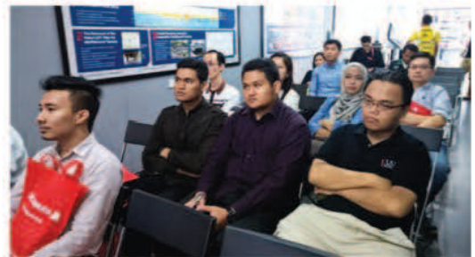
Participants listening to the presentation

Two types of construction methods were used for underground stations. The top-down method was meant for congested areas while bottom-up method was used where space was limited.