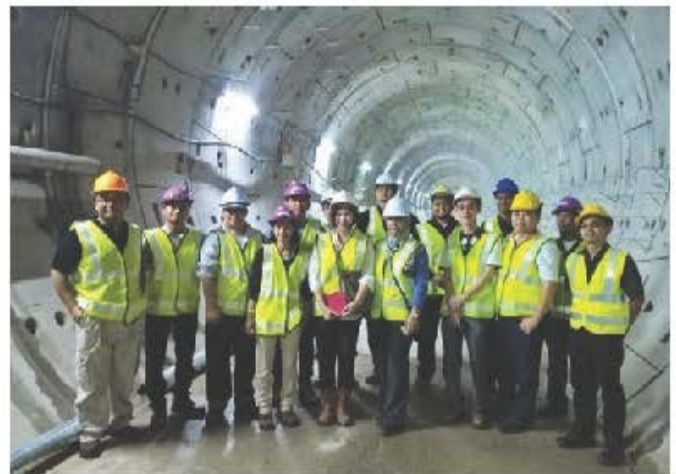
EM group picture in the tunnel

Electrical Services: The system provides power supply to each station via a 33kV network along the tunnels. Dual 33kV power supply will be stepped down to 415V power supply in power equipment room for distribution. As a reliable and safe power supply to stations and railway system equipment is vital, there are three types of power supply modes. First, the normal mode supply to all load equipment when all power supplies are healthy. Second, the essential mode supply to essential load equipment when one supply source fail. Third, the very essential mode (UPS) supply to critical load equipment when all power supplies fail.