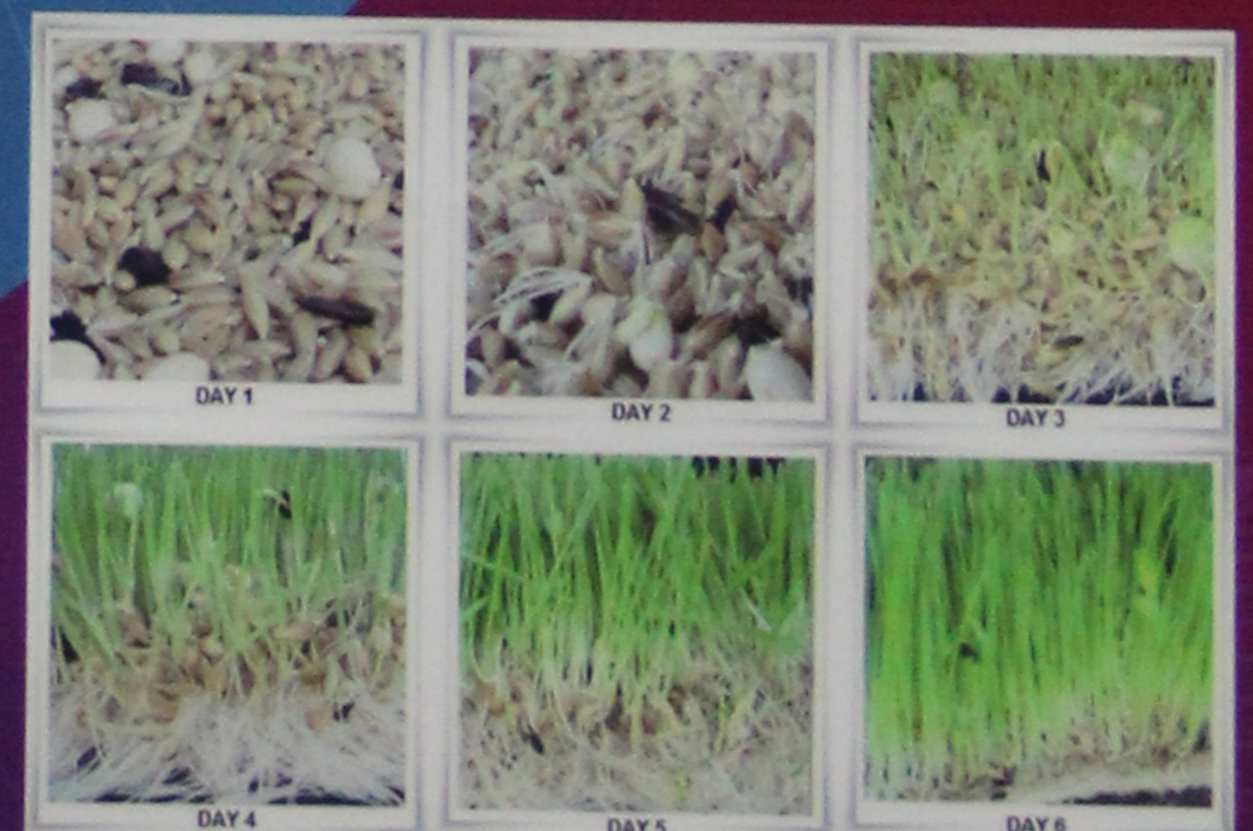
Figure 3. The barley plant in the developed greenhouse