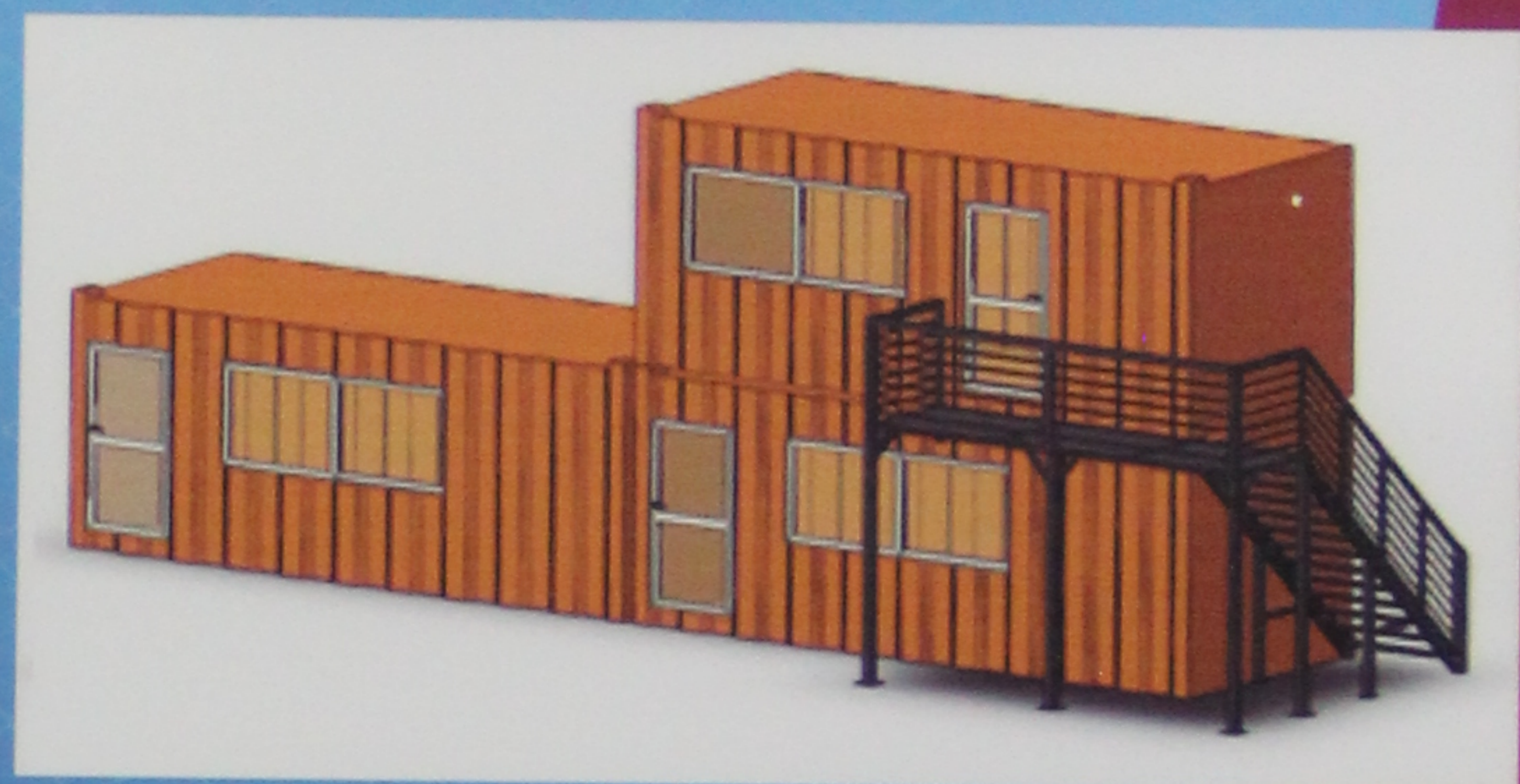
Figure 1. The greenhouse drawing

Currently, this product is used for barley plant at KM 28, border of Perlis and Kedah. In this house, the barley is able to grow and the tree can be harvested in six days once the seed is planted. The barley tree has full of nutrition and very good for livestock such as cow and goat. This may replace other bran which is quite expensive and also it continuously provides food for the livestock during the drought season.