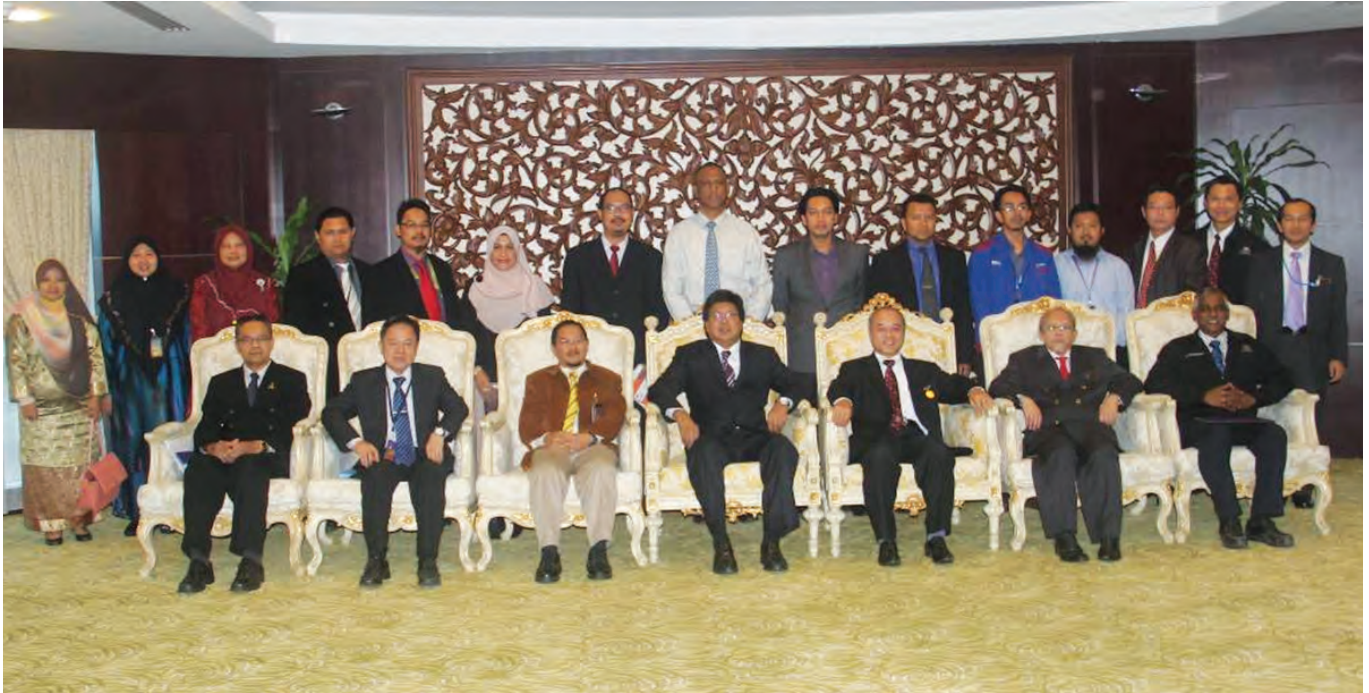
Group photo during the MoU Signing Ceremony