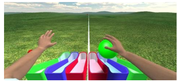
Fig. 5: Placing Game. Rehabilitation training task combining reaching and grasping exercises

Since this project needs to do the virtual rehabilitation, software that is suits is Quest3D software which is a platform for VR system for virtual hand. Quest3D is software for developing real-time 3D Microsoft Windows applications. It's consists of only a few high level software tools and almost all tasks are performed identical to the hardware. By using the software development kit, users can build their own components for Quest3D and build support for specific hardware such as dataglove. The Virtual Reality Peripheral Network (VRPN) will be used to interfaced the dataglove with VR environment and HMD. VRPN is a zero cost, open source tool that can handles many VR devices.