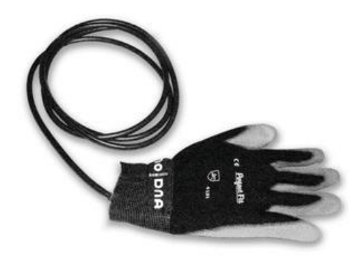
Fig. 1: X-IST CyberGlove made by Immersion Corp.

Additionally, dataglove is likewise utilized within the study of hand rehabilitation by combining together with a VRsystem (Wang Junhua, 2010) and head mounted display (HMD). It has various sensors which accurately give the orientation of bending fingers and the whole hand as well as position of the fingers. Magnetic resonance sensors are placed at the fingertips of the gloves for the positioning purpose. Software on the computer takes the relative orientation of the fingers in space given by the sensor and maps it on to a simulated hand. The rotation and orientation of the hand is captured by other sensors like accelerometers and gyroscopes and integrated with other positional information. The bending ofthe fingers is sensed by a technique by using optical sensors which can tell how much a fingeris bent by the amount of light reaching it through an optical fiber. The more the fingeris bent, the more the light through the fiber is restricted and hence gives an indication of the amount of bend.