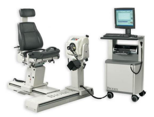
Fig. 4: Biodex System 4 Pro

In recent times, specialist manufactures in oversea have previously offered a line of multi-functional rehabilitation devices (Chen Hao et al. , 2010). For instance, the Proxomed Corporation in Germany has designed a Compass for medical related application in neuro-rehabilitation and orthopedic as well as in sports medicine and geriatric. Hocoma a Switzerland Manufacturers has offered a computerized robotic gait evaluation and training system which can be used for robotic treadmill training of patients with movement troubles (Chen Hao et al. , 2010). The solution of Biodex USA is a Multi-joint System 4 as shown in Fig. 4, an adaptable ergometer that suits the requirements of wellness, sports medicine, cardiac, orthopedic rehabilitation, or general conditioning program. Each one of these devices focuses the complete process from training the patients and assessment. Furthermore, many highly developed technologies in other areas can be applied for rehabilitation training such as 3D motion image capture system and VR technology. It is actually designed for special effects of entertainment or film and motion analysis, but additionally can be used in the gait analysis (Wang Junhua, 2010).