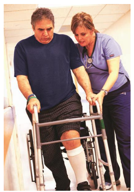
Fig. 5: A stroke patient at Rehabilitation Hospital

patients relearn skills which are lost when part of the brain is damaged. To illustrate, these types of skills range from performing the steps involved in every complex activity such as dress using only one hand or coordinating leg movements in order to walk as shown in Fig. 5. Rehabilitation specialists said that the key element in any rehabilitation program is repetitive practice, well-focused and carefully directed. The similar type of training utilized by everybody when they learn a new skill for example pitching a baseball or playing the piano.