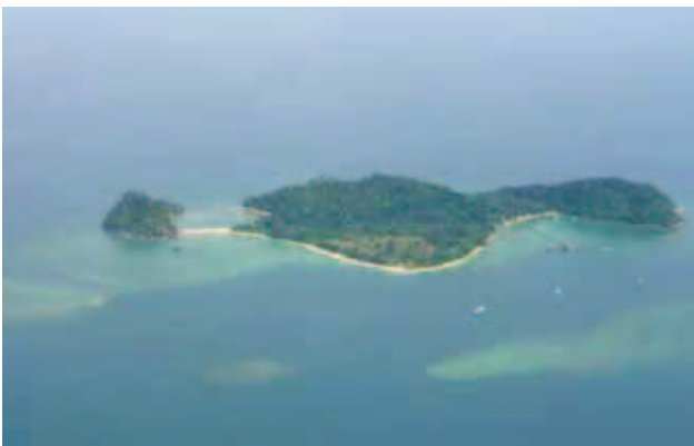
A view taken from the plane before landing at Kota Kinabalu International Airport