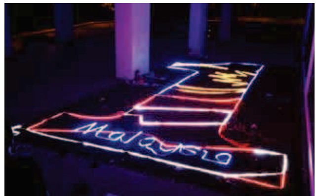
The 1Malaysia logo set up before the sunrise at Mount Kinabalu

Soon after, we began our descend from the peak and then collected our backpacks from the hostel. We arrived at the foot of the mountain at about 4.30 p.m. and each of us was awarded a certificate to record our achievement in completing the climb.