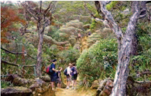
The view along the trail up to Laban Rata

After 8 hours of continuous hiking, we arrived at Laban Rata. It was a tiring journey made worthwhile when we got to see the magnificent panoramic view – looking at the clouds below us from where we stood. The first thing that came to our minds was to grab some food at the restaurant. However, the restaurant was crowded as everyone seemed to have reached the stop at around the same time.