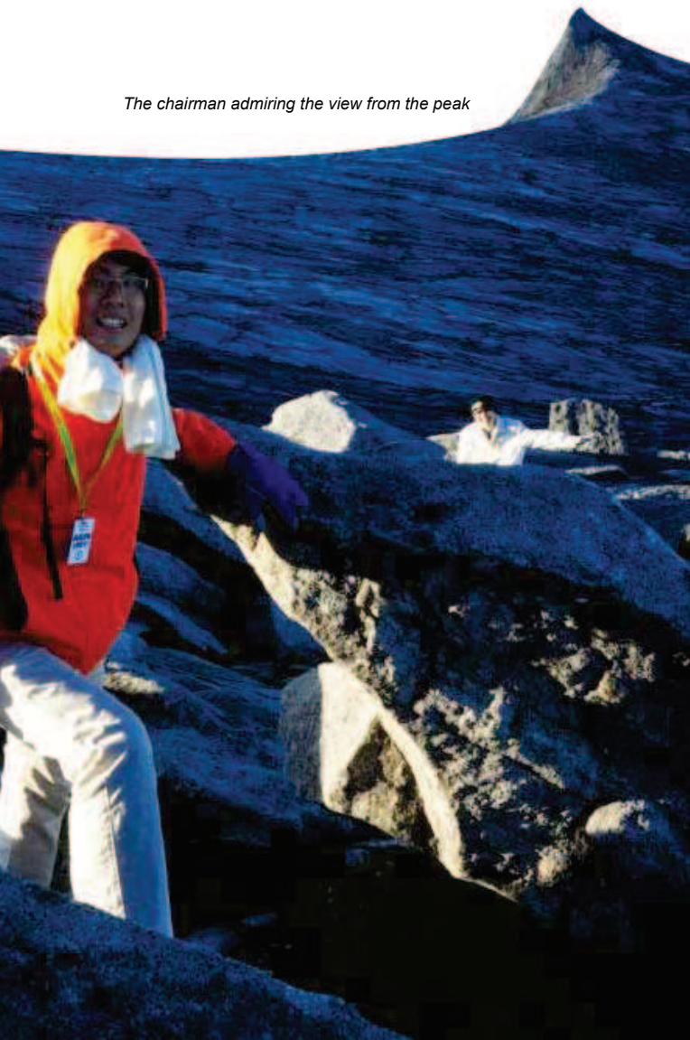
The chairman admiring the view from the peak

On the final day, we boarded the flight back to Kuala Lumpur just before noon. It has been a tough yet enjoyable trip. Also, we were lucky to have had a group of friends who encouraged each other to complete the tough hike without giving up. It was only through this perseverance and determination that enabled us to reach the peak. Hopefully, we could have another hiking activity soon. ■