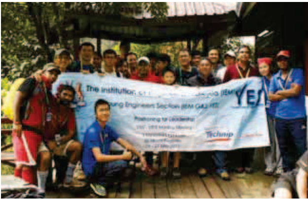
A group photo taken at the Mesilau gate before starting the journey

After 8 hours of continuous hiking, we arrived at Laban Rata. It was a tiring journey made worthwhile when we got to see the magnificent panoramic view – looking at the clouds below us from where we stood. The first thing that came to our minds was to grab some food at the restaurant. However, the restaurant was crowded as everyone seemed to have reached the stop at around the same time.