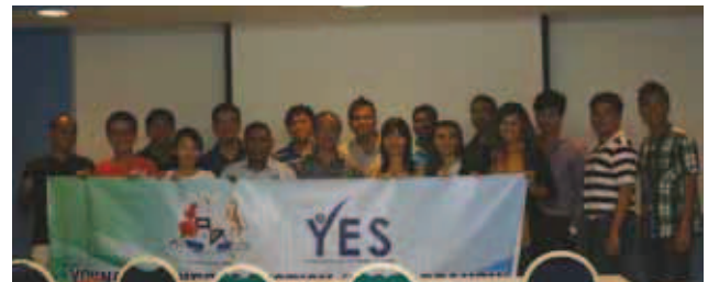
A group picture with Sabah YES committee members

We woke up early at 7.00 a.m. the following day and gathered at the hotel lobby to wait for the assigned van to pick us up. It took us about 2 hours to reach the foothills of Mount Kinabalu. After registration, we collected our name tags and headed towards Mesilau gate, the more difficult trail which provided a wonderful view of flora and fauna.