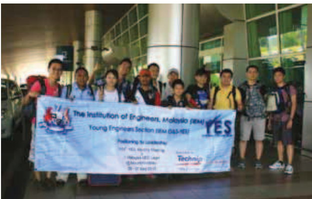
A group photo taken at the Sabah International Airport

On the first day of the trip, the flight departed from LCCT at 10.25 a.m. and reached Kota Kinabalu International Airport at 1.00 p.m. After a group photograph at the airport, the participants headed to the designated hotel by taxi. The hotel was located strategically in the town centre, with a wide choice of food outlets and a convenience store.