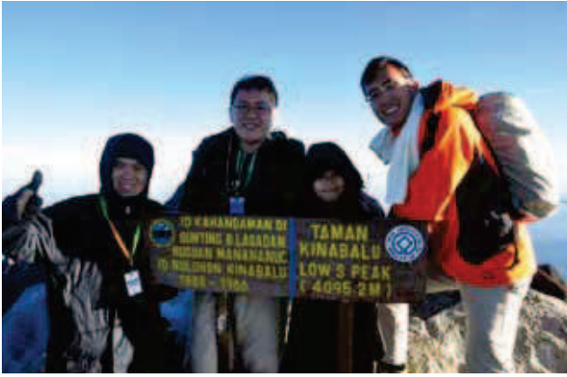
Happy smiles at Low's Peak

On the final day, we boarded the flight back to Kuala Lumpur just before noon. It has been a tough yet enjoyable trip. Also, we were lucky to have had a group of friends who encouraged each other to complete the tough hike without giving up. It was only through this perseverance and determination that enabled us to reach the peak. Hopefully, we could have another hiking activity soon. ■