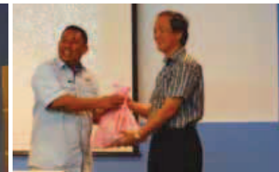
A token of appreciation received from the YES advisor, IEM Sabah Branch