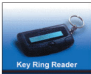
Figure 2: A Mobile Card Acceptance Device (Mobile CAD) and a Key Ring Reader

It is to be noted that MyKad does not replace the passport, since it is still required as the official entry and exit document when traveling overseas.