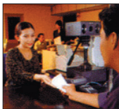
Figure 3: MyKad Application Process

For further information, you can check the NRD's website at: http://www.jpn.gov.my/