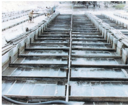
Figure 11: A naked palong-showing the riffles for trapping tin ore