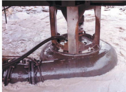
Figure 6: The gravel pump; Gravel pump method is named after this equipment