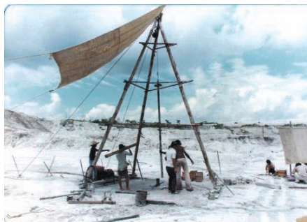
Figure 2: Prospecting for tin using the wash boring method