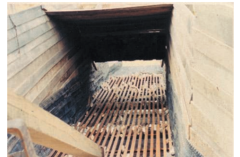
Figure 9: A fixed screen to screen the large materials such as gravel and stones

becomes difficult to agitate, additional timbers are added on the original ones. The tin ore is trapped in the riffles.