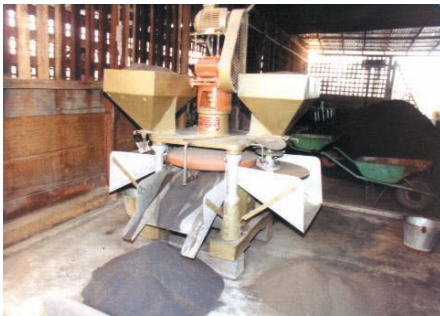
Figure 17: Magnetic separator to dress tin ore

concentrates when the ore is sold to the smelters. Nitric acid is often used to remove impurities. The more efficient mines have concentrating tables (Figure 16) for dressing the materials which give a higher recovery rate. Tin ore is then dried in a furnace and packed into bags for sale. The residual after extracting the tin ore is known as amang which contains other heavy minerals and a small percentage of tin ore. Coarse tin ore has more impurities and has to be crushed and grinded. Larger mines process their own amang utilising crushers, grinding and magnetic separators to extract the tin ore. Figure 17 shows a typical magnetic separator.