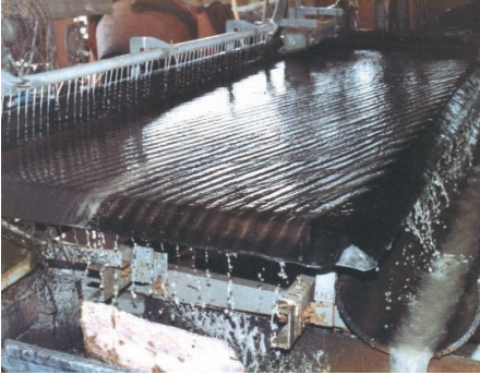
Figure 16: Concentrating or shaking table for tin ore dressing