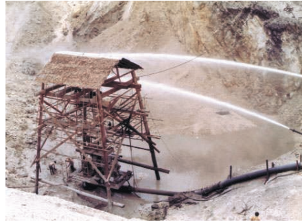
Figure 5: Monitors and the gravel pump

Excavators would be used to dig and break up the clayey material. Clayey deposits are tough for the monitors to break down. Further more