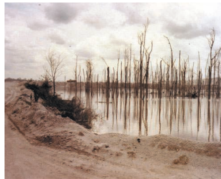
Figure 12: Tailings retention ponds