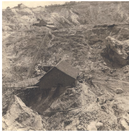
Figure 1: A gravel pump tin mine in Tronoh, Perak (1952). The engine used was large in size but low in capacity. Interestingly one engine run both the water and gravel pumps. The engine had to be housed in a big hut.

Since the collapse of the world tin market in 1985, the tin mining industry has been on a very steep decline. The number of tin mines now operating in Malaysia is less than 25, a far cry from the 1000's in the 1970s, producing a mere 3000 tonnes.