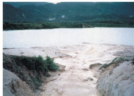
Figure 13: Tailings dumped into ex-mining pool by gravity