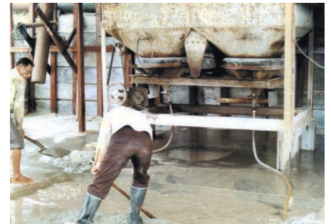
Figure 14: Washing of the palong using jigs

Drainage is one of the most important operations in gravel pump mining. Closed-circuit system of drainage is normally practised. Water is re-cycled for use. One of the common problems in open cut mining is ground water control. Mine has to be drained by pumps and in deep mine, dewatering can be non stop. For this reason, some deep mines work 24 hours.