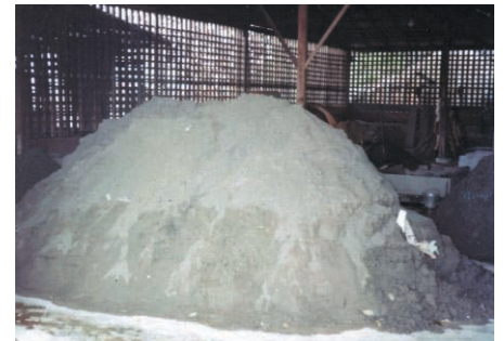
Figure 15: Rough concentrates recovered from the jigs