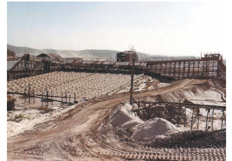
Figure 8: A Palong; a rare sight nowadays

Palong is essentially a big wooden sluice box and the early palong had single or twin lanes. Palong for gold mining normally has two lanes and a gentle slope (Figure 10). Typical dimensions of palong are 50m long, 2m wide lane of at least 12 lanes. Transverse timbers (100mmx50mm) are placed as riffles to agitate the slurry and form eddies as shown in Figure 11. As the heavy materials accumulate and when it