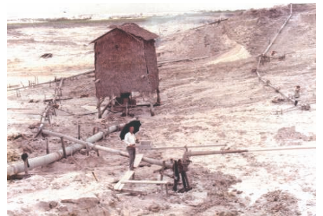
Figure 4: Wet stripping of the overburden by gravel pump