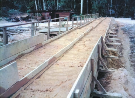
Figure 10: An example of a gold mining palong materials needed to be treated. Most of the tin ore is caught at the top 10m of the palong. A well designed and managed palong can recover 80% of the tin ore.