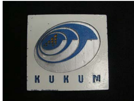
b) KUKUM logo