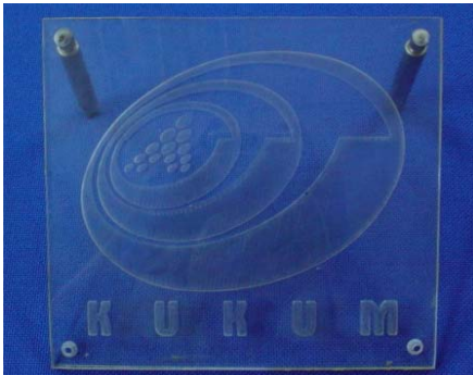
(a) Acrylic pattern

are easier due to the light weight pattern. Better finishing product can be obtained by using this technique.