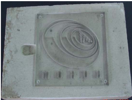
(e) Bottom mould with acrylic pattern