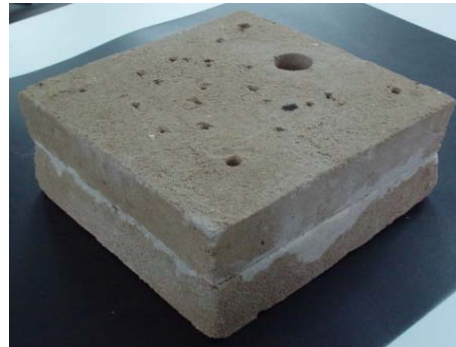
(d) Mould after hardening process