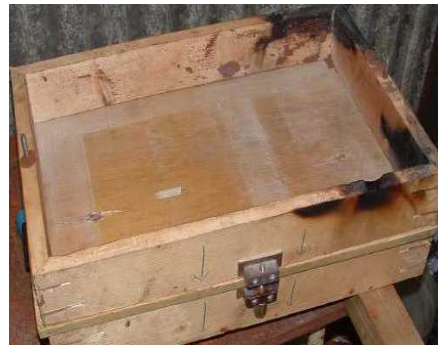
(b) Moulding box