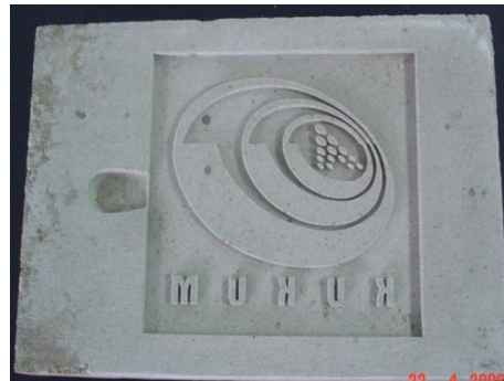
(f) Bottom mould without acrylic pattern