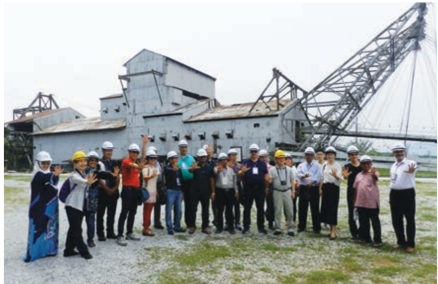
Visit to a relic tin dredge in Tualang – heritage of Malaysia's tin production days

exulted from people coming together to express their thoughts, share ideas and enjoy the company of each other. The innocuous way that international meetings can promote friendship, understanding and a