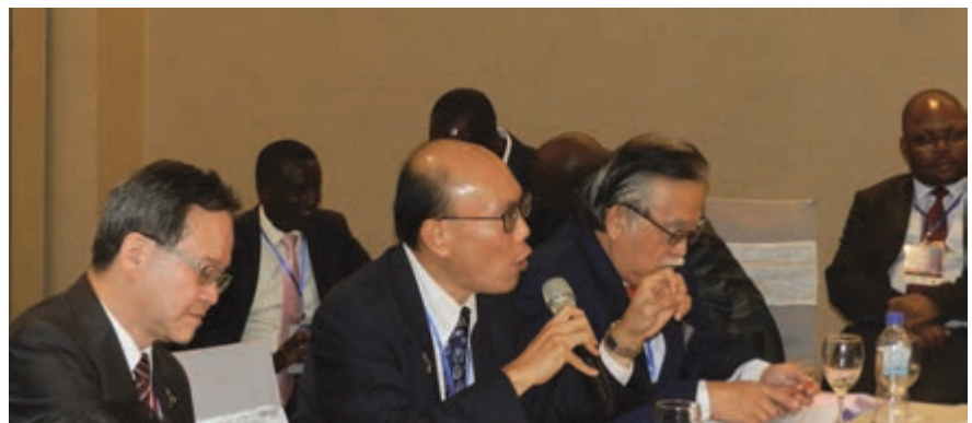
FEIAP Meeting in session L to R: FEIAP President, FEIAP Sec Gen, IEM President

With the curtains drawn on the FEIAP GA, I sit back and ponder on what has been the impact of such international meetings. What I can see is the sense of cooperation, motivation and camaraderie that