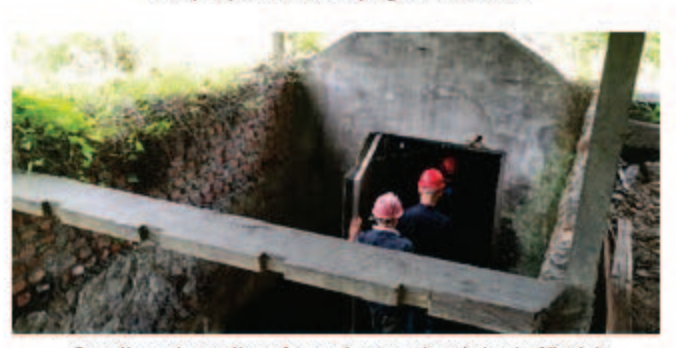
Compliance inspection of an underground coalmine in Silante k